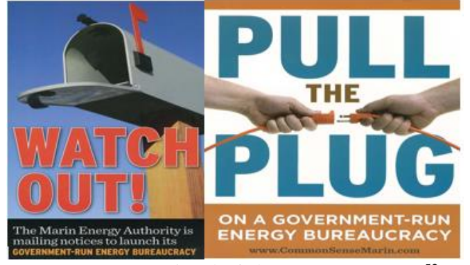
Figure 3: Examples of Ads from MCE Opponents<sup>52</sup>

MCE faced similar PG&E opposition. Retired PG&E engineers sent letters to elected officials, media outlets, and community-based organizations stating that the CCA would not work and sowing fear that the lights would go out if Marin were to join.<sup>47</sup> Among the tactics used was sending mailers to residents under the name of the "Common Sense Coalition," a group whose president and vice president were both current or former PG&E vice presidents (Figure 3).<sup>48</sup> One of these mailers looked like an official opt-out notice, which led to CPUC threatening PG&E with "significant and continuing fines."<sup>49</sup> In addition, PG&E provided $44.1 million<sup>50</sup> to promote Proposition 16 on the 2010 state ballot, which would have severely hindered the ability of CCAs to form, virtually eliminating the possibilities of CCAs before they even launched.<sup>51</sup>